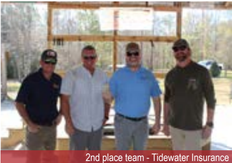
2nd place team - Tidewater Insurance