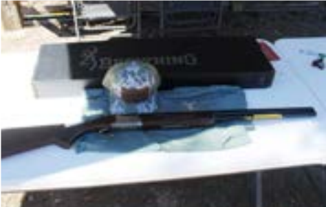
Browning Citori shotgun that was raffled off