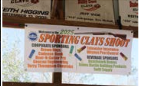
Thank you to our event sponsors