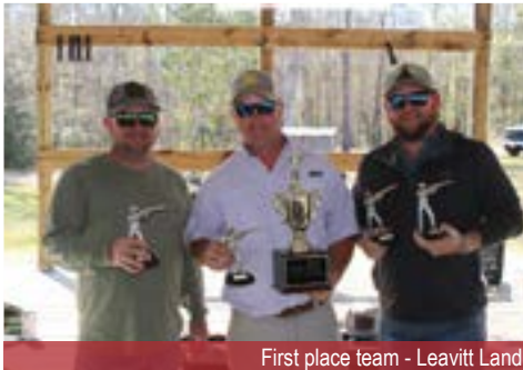
First place team - Leavitt Land