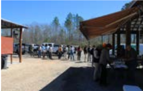
Lunch and dinner provided by Wilton's Catering