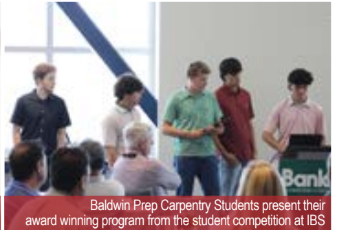
Baldwin Prep Carpentry Students present their award winning program from the student competition at IBS