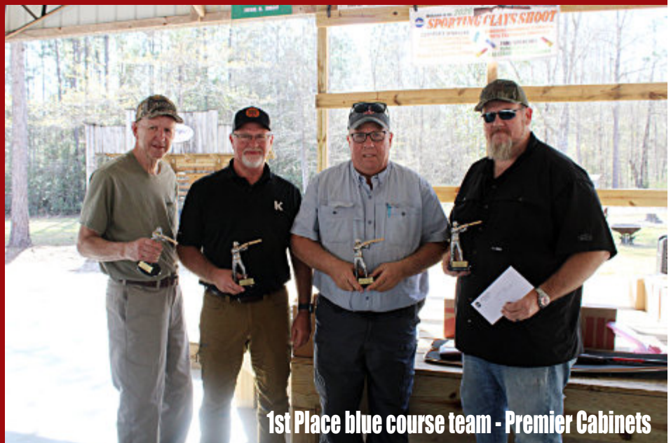
1st Place blue course team - Premier Cabinets