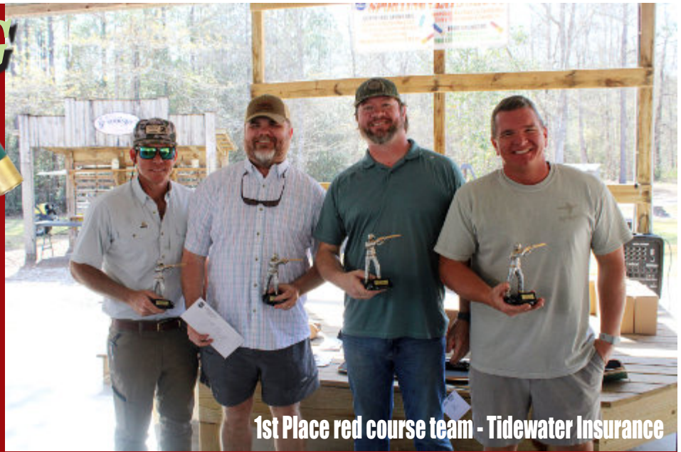
1st Place red course team - Tidewater Insurance