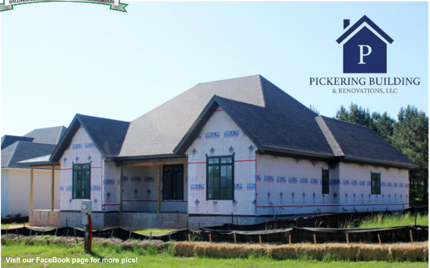
Visit our FaceBook page for more pics!

Located on Lot 93 in the North Hills at Fairhope Subdivision, this year's Showcase Home is being built by Pickering Building and Renovations LLC. If you would like to enter a home in this year's Parade or are interested in supporting the Parade with a discount to the builders. Please see the forms in this issue of the Plumblin. Parade sponsorships are available! Please visit https://www.bchba.com/assets/pdf/2026marketingguide2 for full details.